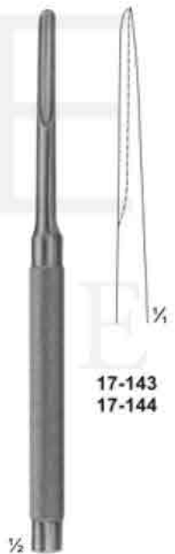
LUCAS 17-143 - 144 Gouges 160 mm