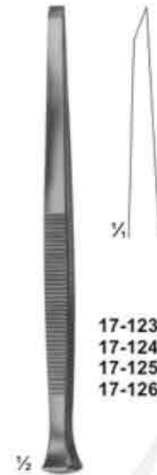
PARTSCH 17-123 - 126 Chisels 140 mm

17-118 4 mm 17-119 6 mm 17-120 8 mm 17-121 10 mm 17-122 12 mm