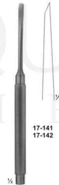
LUCAS 17-141 - 142 Chisels 160 mm

17-136 3 mm 17-137 4 mm 17-138 5 mm 17-139 6 mm 17-140 7 mm