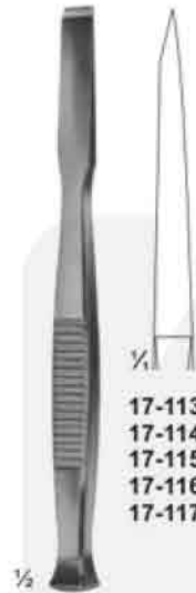
17-113 - 117 Chisels 140 mm

17-108 4 mm 17-109 6 mm 17-110 8 mm 17-111 10 mm 17-112 12 mm