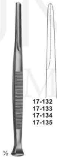
PARTSCH 17-132 - 135 Gouges 140 mm

17-127 3 mm 17-128 4 mm 17-129 5 mm 17-130 6 mm 17-131 7 mm