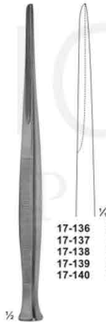
PARTSCH 17-136 - 140 Gouges 170 mm

17-132 3 mm 17-133 4 mm 17-134 5 mm 17-135 6 mm