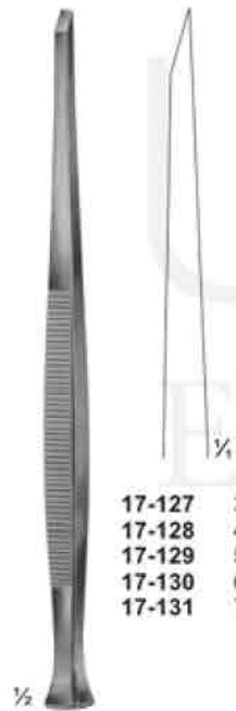
PARTSCH 17-127 - 131 Chisels 170 mm

17-123 3 mm 17-124 4 mm 17-125 5 mm 17-126 6 mm