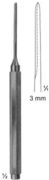
17-107 MANNERFELT Gouge 155 mm