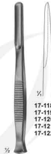
17-118 - 122 Gouges 140 mm

17-113 4 mm 17-114 6 mm 17-115 8 mm 17-116 10 mm 17-117 12 mm