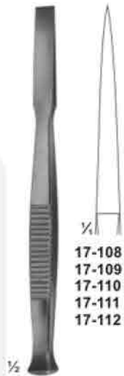
17-108 - 112 Osteotomes 140 mm

17-108 4 mm 17-109 6 mm 17-110 8 mm 17-111 10 mm 17-112 12 mm