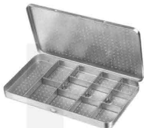
19-187 Sauerbruch 210 x 125 x 17 mm