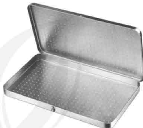
19-188 Sauerbruch 210 x 125 x 17 mm