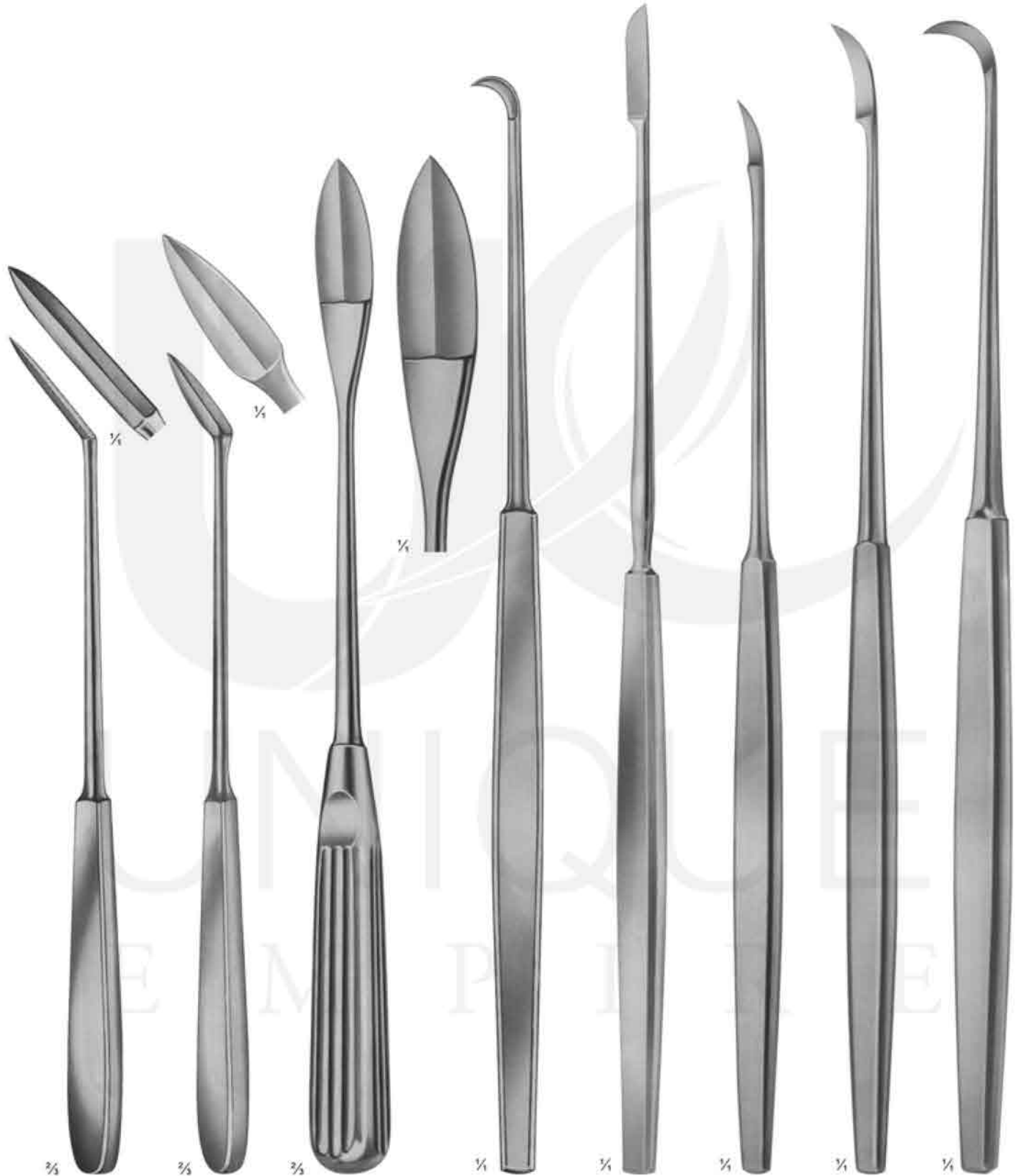
02-122 AYRE Size: 235 mm Cone Knife