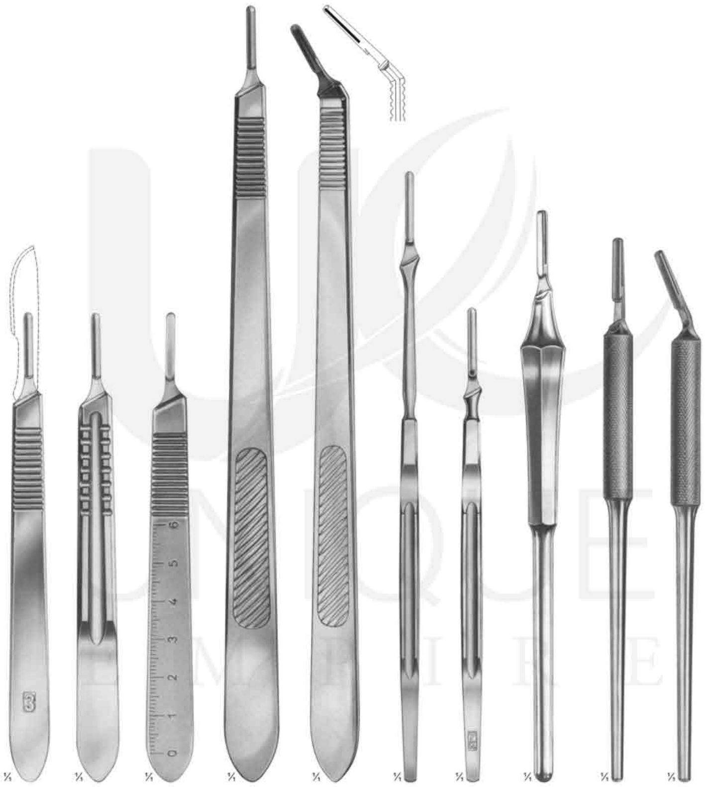
02-130 STANDARD No. 3 Solid 12 cm 02-131 No. 3 Solid 12 cm 02-132 No. 3 Solid 12 cm 02-133 No. 3 L Straight Solid 21.5 cm 02-134 No. 3 L Angled Solid 21 cm 02-135 No. 7 Solid 16 cm 02-136 No. 7 K Solid 12.5 cm 02-137 Hollow-Round 15.5 cm 02-138 No. 3 Straight Solid, Round 14.5 cm 02-139 No. 3 Angled Solid, Round 14 cm