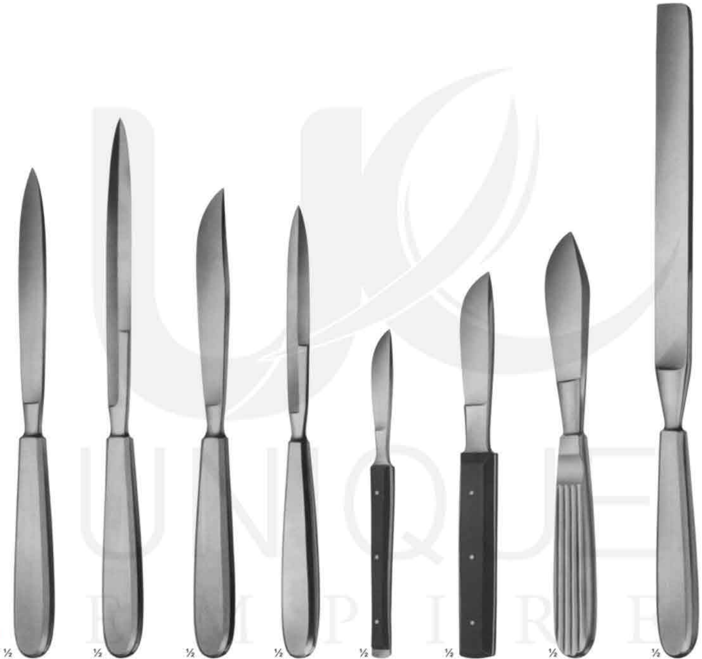
LISTON 02-111 Size: 130 mm 02-115 CATLIN Size: 160 mm 02-116 LANGENBECK Size: 120 mm 02-117 Size: 110 mm 02-118 Size: 55 mm 02-119 Size: 70 mm 02-120 Size: 80 mm 02-121 Size: 195 mm 02-112 Size: 160 mm Blade length Blade length Blade length Blade length Blade length Blade length Blade length 02-113 Size: 190 mm Amputating Flap Knives Interosseous with raspatory, Wooden handle Metal handle Metal handle 02-114 Size: 200 mm Knives Knives Wooden handle